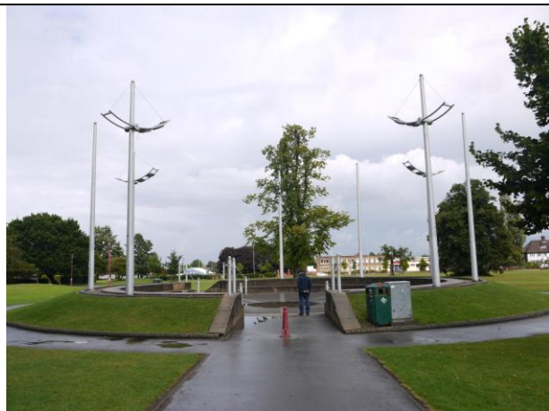
14. Performance space, Mawson's "The Greeting"