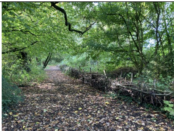
29. A dead hedge protecting habitat