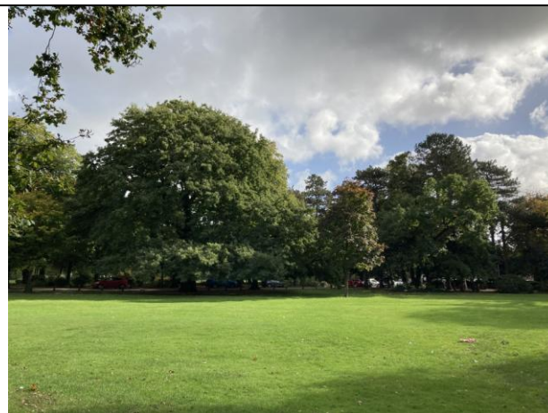
4. Turkey Oak and other mature trees along drive near Hall