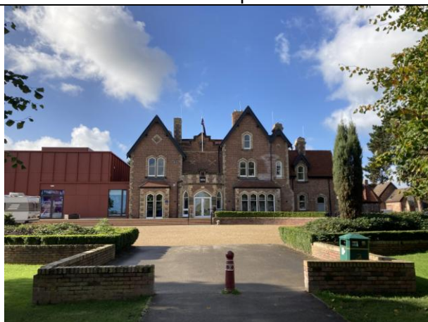
19. Hall, new theatre extension and forecourt