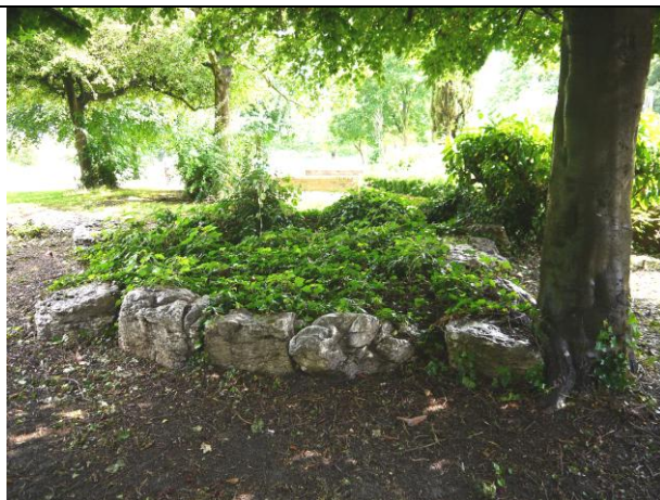
17. Rockwork around the pond