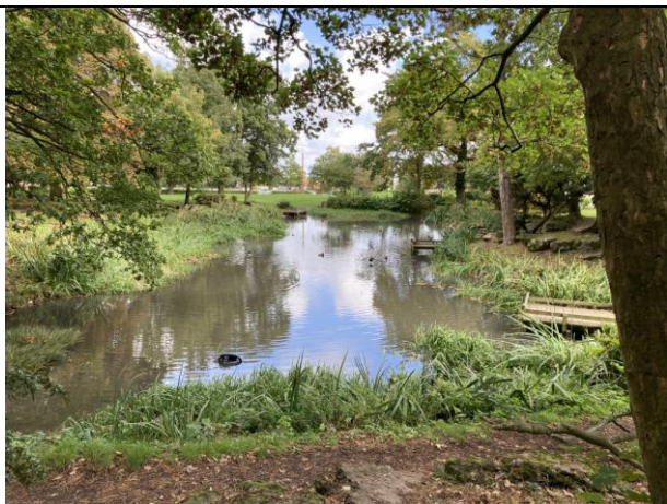
16. Pond with fishing platforms