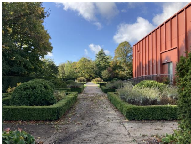
22. Panel beds to Mawson's design