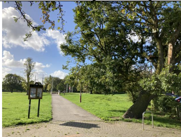
12. Path from car park to performance area