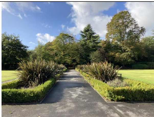
23. Beds between the bowling greens