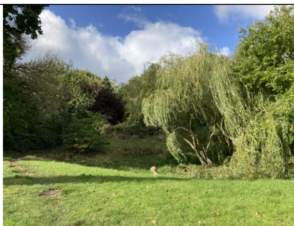
27. Former pond which Mawson proposed should be an aquatic area