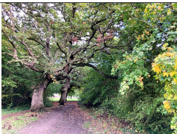
32. Line of mature oak north of tennis courts