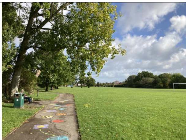
21. Path south of Hall grounds