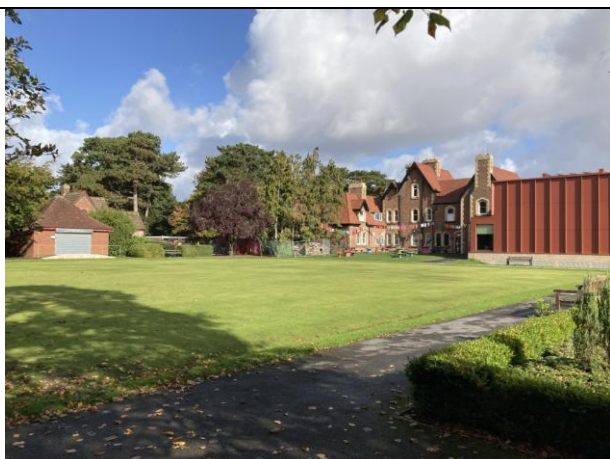
24. Northern bowling pavilion c. 1984