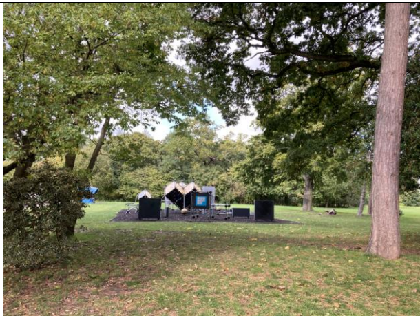
36. Parkour area east of skate park