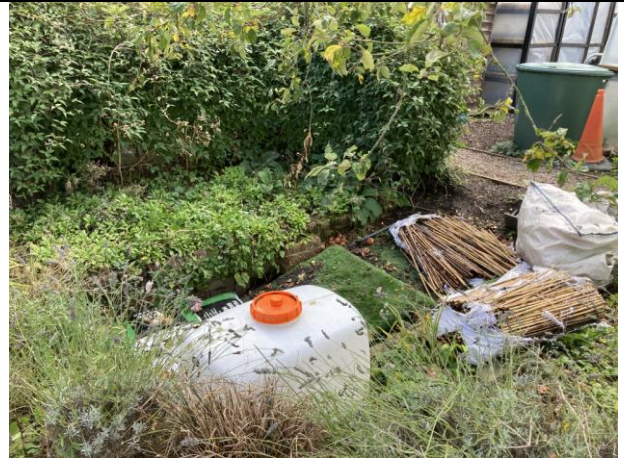
11. Former manure pit