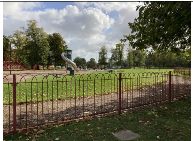
37. Play area in north corner of park near Stanney lane entrance, location suggested by Mawson.

Please note that this report contains the research and recording information available to Cheshire Gardens Trust at the time. It does not purport to be the finite sum of knowledge about the site as new information is always being discovered and sites change.