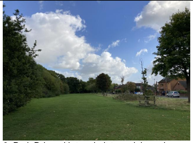
6. Park Drive with tree belt to park boundary