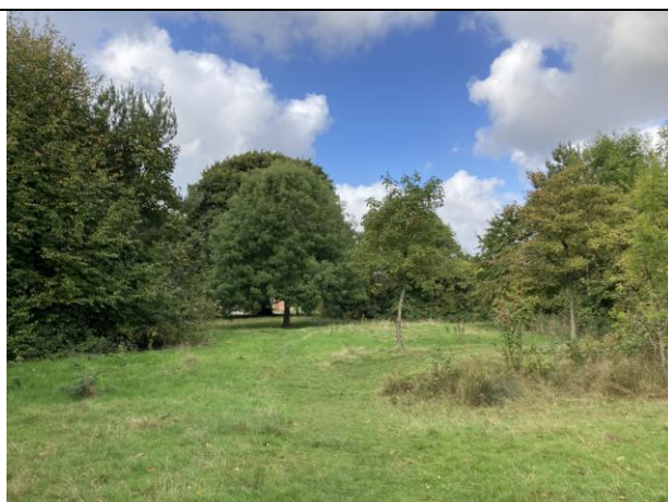
33. Naturalistic woodland by Thamesdale