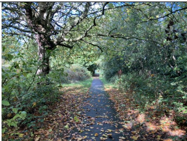
28. Path from site of rose garden northwards