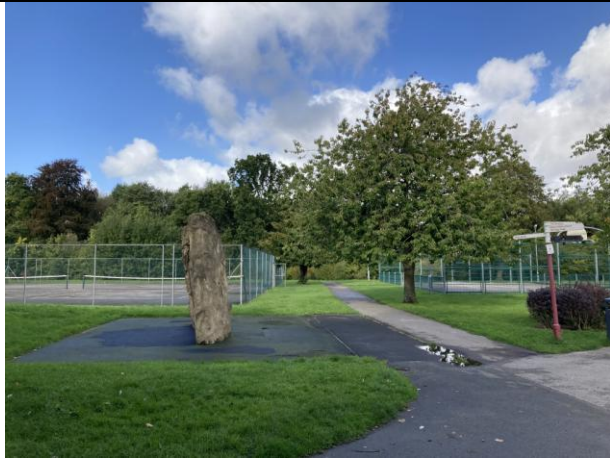
34. Climbing boulder and central path between tennis courts, as designed by Mawson, court on right now a multi use games court.