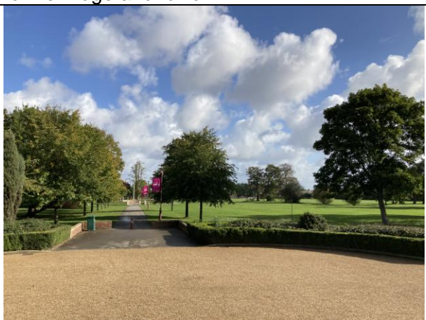
20. View from the Hall towards the Greeting.