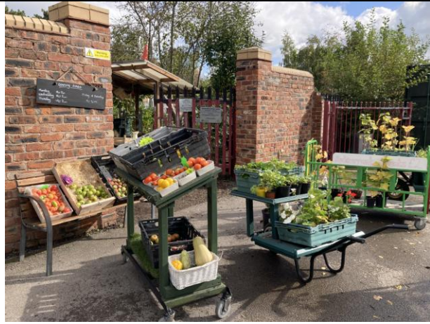
10. Produce for sale at gate of walled garden