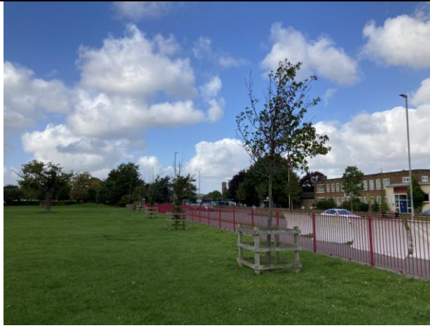
5. Stanney Lane boundary