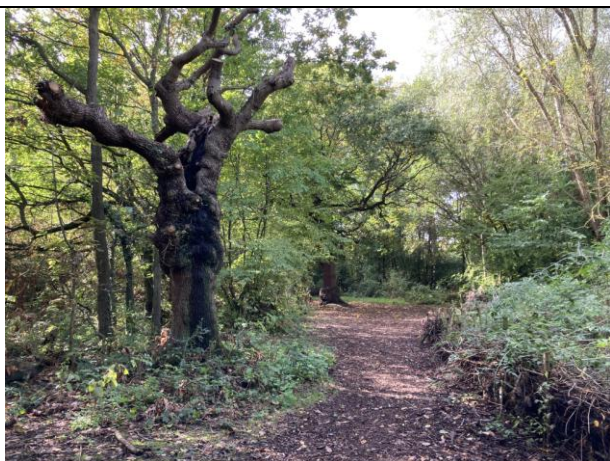
30. Veteran hedgerow trees