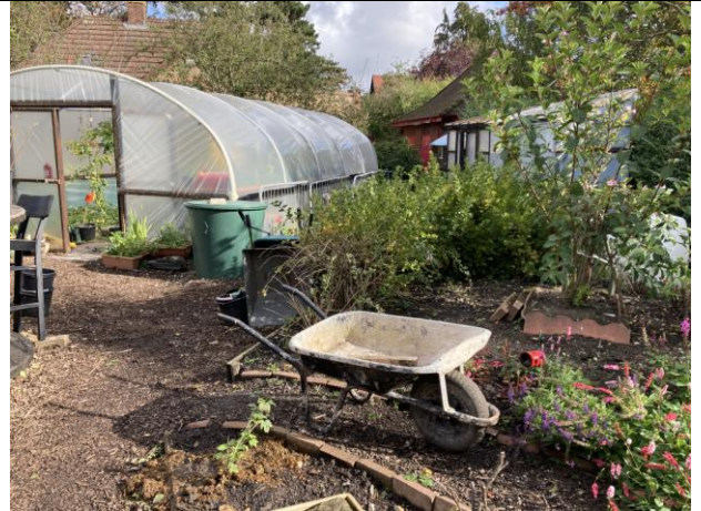
8. Whitby Park Community Garden