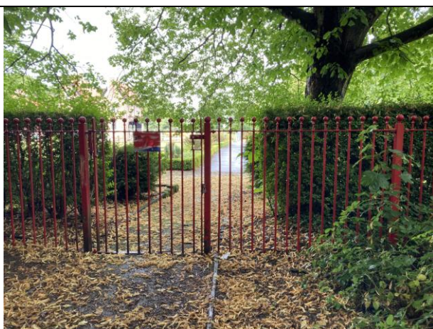
26. Gated entrance west of bowling greens