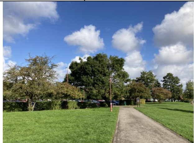
13. View back towards car park bounded by former hedge line