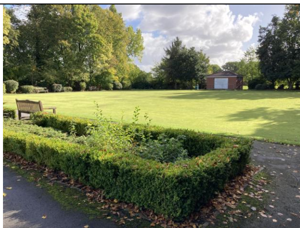
25. Southern bowling pavilion