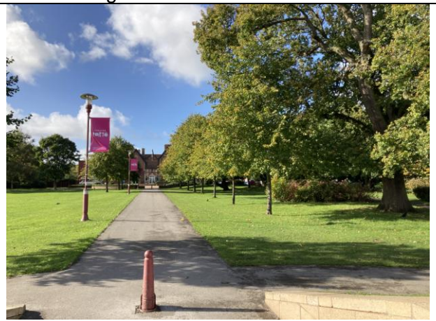
15. Path from "the Greeting" to the Hall