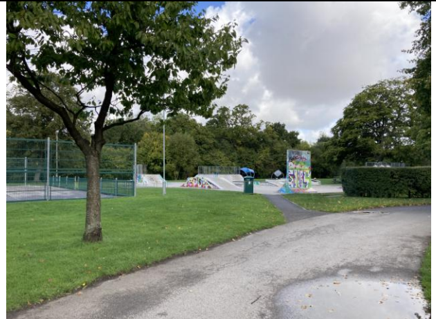
35. Wheels park east of tennis courts