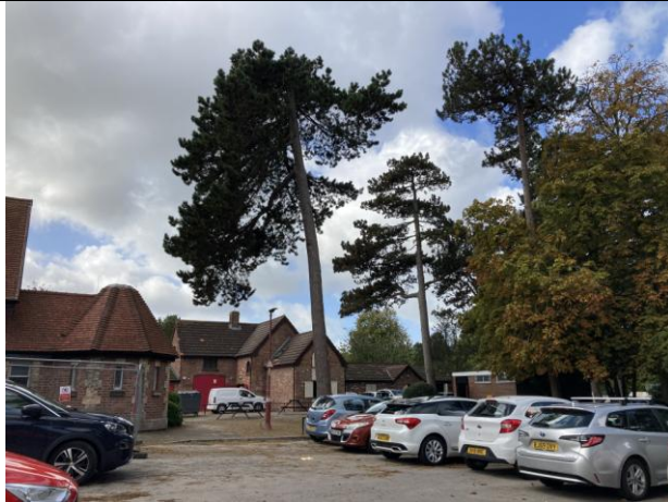
7. Parking by outbuildings