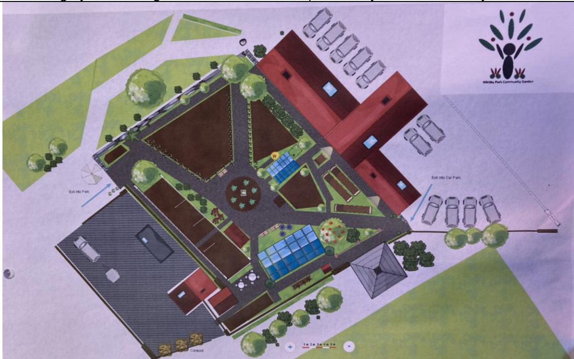
9. Plan of community garden