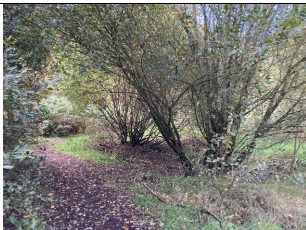
31. Shrubby willows and bark paths