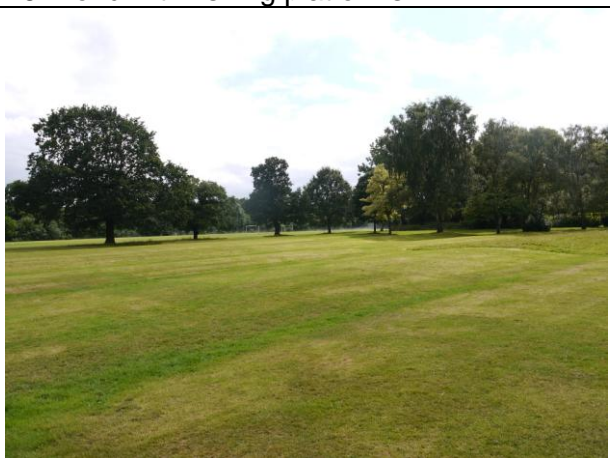
18. Wildflower grassland with evidence of former ridge and furrow