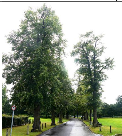
3. Lime avenue along original drive